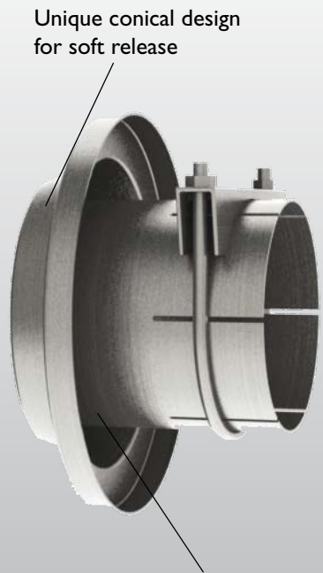
Unique conical design for soft release